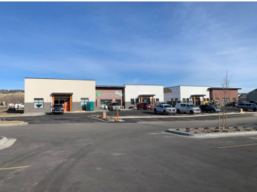
Building Photos (7 photos)

PROJECT: 38TH STREET PLAZA WEST BUILDING 1423 38TH STREET WEST BILLINGS, MONTANA 59102 SET: PROJECT NO. 2119 DRAWN BY: SBH CHECKED BY: JBN DATES: PRE: 3.08.21 MD: 6.02.22 CRS: 5.01.22 REV: 5.09.22 REV: 6.2.22 SHEET: 1.1 A LEASING